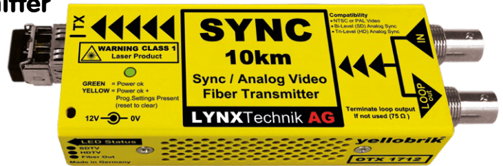
OTX 1712-2 LC Version Shown

The OTX 1712-2 provides a passive loop output and support for LC, ST or SC singlemode fiber connections. An LC version suitable for multimode fiber is also available.