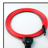
P-TAP 1000 Use with a standard battery P-TAP power source.

The kit INCLUDES AC power supplies. The power adapters below are optional.