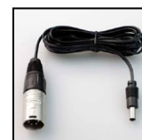
XLR 1000 Use with a standard 4 pin XLR camera battery power source.