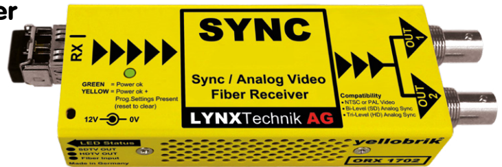
ORX 1702-1 LC Version Shown