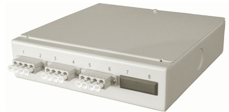
4, 8 & 16 Way LC wall boxes shown

Multi Mode adapters are suitable for all types of Multi Mode 62.5/125 and 50/125 cable; Single Mode are suitable for both Single Mode 9/125 and Multi Mode cables.