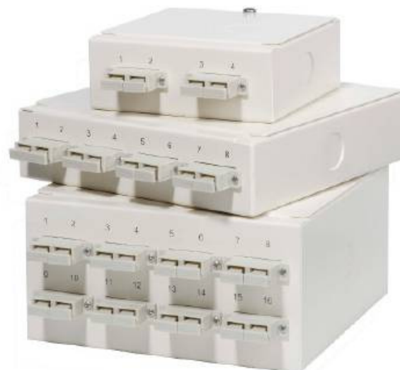
4, 8 & 16 Way SC wall boxes shown

Multi Mode adapters are suitable for all types of Multi Mode 62.5/125 and 50/125 cable; Single Mode are suitable for both Single Mode 9/125 and Multi Mode cables.