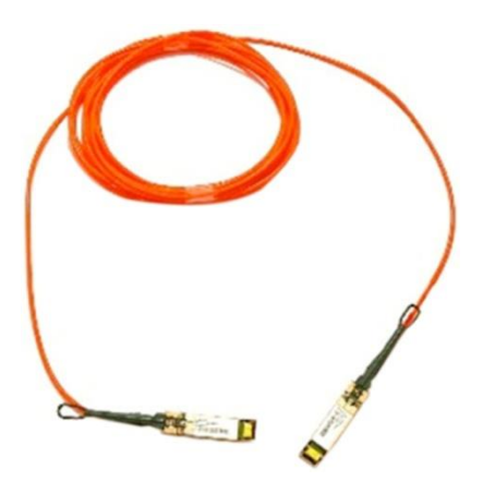
Figure 4. Cisco Direct-Attach Active Optical Cables with SFP+ Connectors