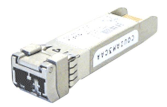
Figure 1. Cisco 10GBASE SFP+ Modules

The Cisco<sup>®</sup> 10GBASE SFP+ modules (Figure 1) give you a wide variety of 10 Gigabit Ethernet connectivity options for data center, enterprise wiring closet, and service provider transport applications.