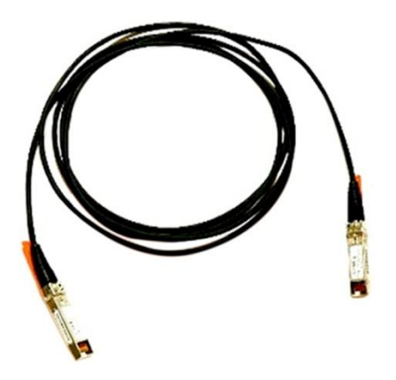
Figure 3. Cisco Direct-Attach Twinax Copper Cable Assembly with SFP+ Connectors

Cisco SFP+ Copper Twinax (Figure 3) direct-attach cables are suitable for very short distances and offer a cost-effective way to connect within racks and across adjacent racks. Cisco offers passive Twinax cables in lengths of 1, 1.5, 2, 2.5, 3 and 5 meters, and active Twinax cables in lengths of 7 and 10 meters.