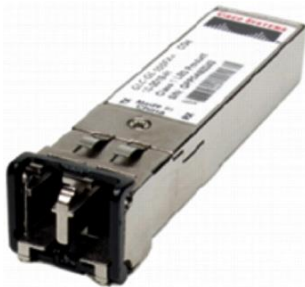
Figure 1. Cisco 100M Ethernet SFP