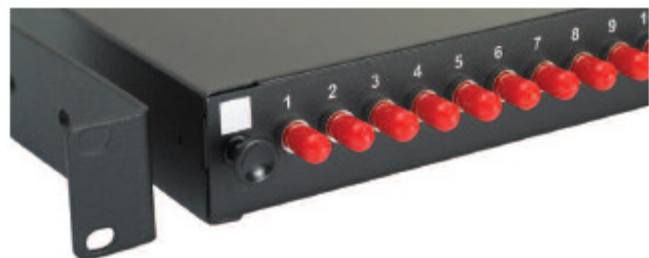
Adjustable Fixing Arms, Port Labelling