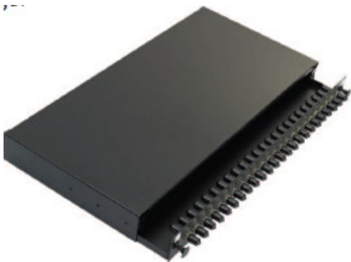
Sliding Drawer Design

To the front of the patch panel the specified number of simplex adaptors are loaded from left to right. The facia also houses the release latches for the sliding drawer. Each adaptor is fitted with a colour coded dust cap, Black for multi mode, Red for single mode. Each simplex adaptor accommodates one terminated fibre. Each panel includes a set of adjustable fixing arms, and a cable management pack which includes cable entry glands, cable ties and a 24 way splice bridge.