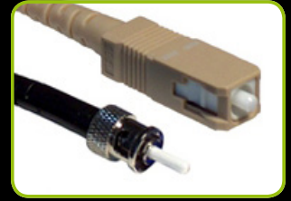
SC (Top) and ST